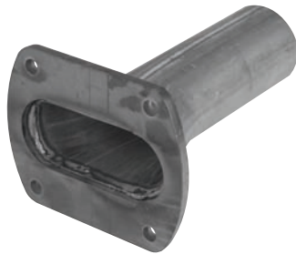
121685 Gasket 9245

1987-95 Ford E-Series 1987-99 Ford F-Series