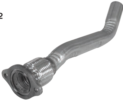
123532 Gasket 8762

1998-03 Chevrolet Malibu 3.1L 1999-04 Oldsmobile Alero 3.4L 1998-99 Oldsmobile Cutlass 3.1L 1999-03 Pontiac Grand Am 3.4L With Inner Braid Flex