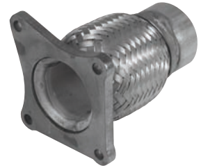
121682 Gasket 9013

642951 1996-99 Dodge Caravan Plymouth Voyager 3.0L With Inner Lock Flex (Inner Heat Shield)