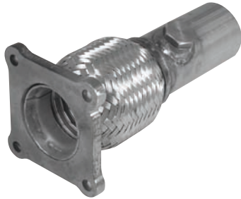
121681 Gasket 9289

1995-00 Chrysler Cirrus, Sebring 2.4L & 2.5L 1995-00 Dodge Stratus 2.0L, 2.4L & 2.5L 1998-00 Plymouth Breeze 2.0L & 2.4L