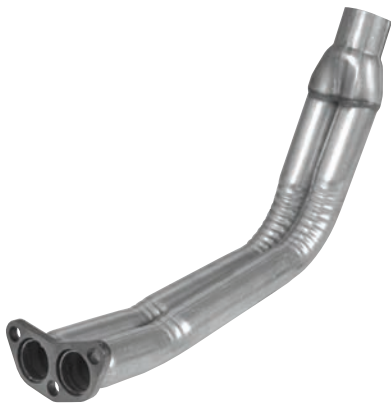
122617 Gasket 8734