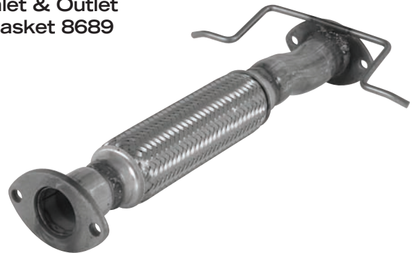
28337 Inlet & Outlet Gasket 8689

1987-95 Ford E-Series 1987-99 Ford F-Series