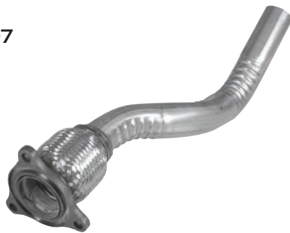
122618 Gasket 9207

1999-02 Chevrolet Cavalier 2.4L 1999-00 Chevrolet Malibu 2.4L 1999-01 Pontiac Grand Am 2.4L 1999-02 Pontiac Sunfire 2.4L 1999-01 Oldsmobile Alero 2.4L