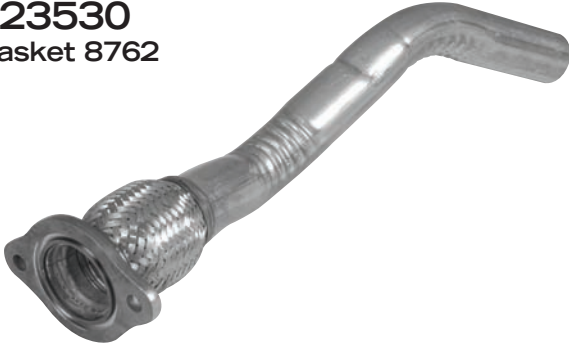
123530 Gasket 8762

1997-00 Chevrolet Venture 3.4L 1997-00 Oldsmobile Silhouette 3.4L 1999-00 Pontiac Montana 3.4L 1997-98 Pontiac Transport 3.4L