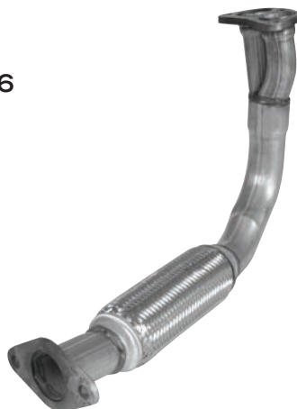
28453 Inlet Gasket 9255 Outlet Gasket 9256

1988-92 Ford Probe, 2.2L A/T also fits Mazda