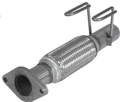
28363 Gasket 9079