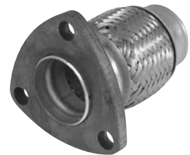
121688 Gasket 8731

1998-00 Chevrolet S10 Pickup 2.2L 1998-00 GMC S15 Sonoma Pickup 2.2L With Inner Braid Flex