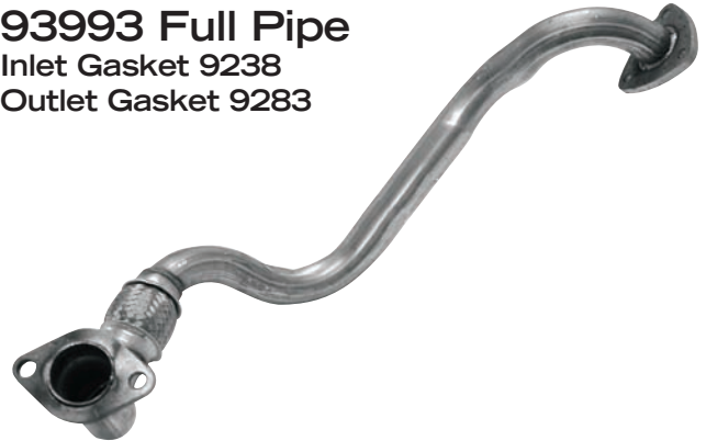
93993 Full Pipe Inlet Gasket 9238 Outlet Gasket 9283

1996-97 Chevrolet S10 Pickup 2.2L 1996-97 GMC S15 Sonoma Pickup 2.2L 1996-97 Isuzu Hombre 2.2L