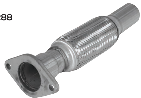
28569 Gasket 9288

1996-99 Ford Taurus 3.0L 1996-99 Mercury Sable 3.0L