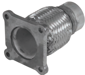
121683 Gasket 9289

1996-00 Chrysler Town & Country, Dodge Caravan, Plymouth Voyager 3.3L & 3.8L 2000-02 Dodge Neon 2.0L With Inner Lock Flex (Inner Heat Shield)