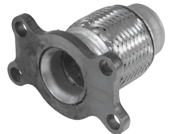
121686 Gasket 9054

1996-98 Buick Skylark 2.4L 1996-98 Chevrolet Cavalier, 97-98 Malibu 2.4L 1996-98 Oldsmobile Achieva 2.4L 1996-98 Pontiac Grand Am, Sunfire 2.4L with Inner Braid Flex