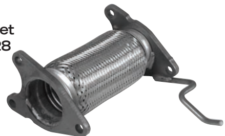
18177 Inlet & Outlet Gasket 8728

1995-00 Ford Contour 2.5L w/ AT 1995-00 Mercury Mystique 2.5L w/ AT