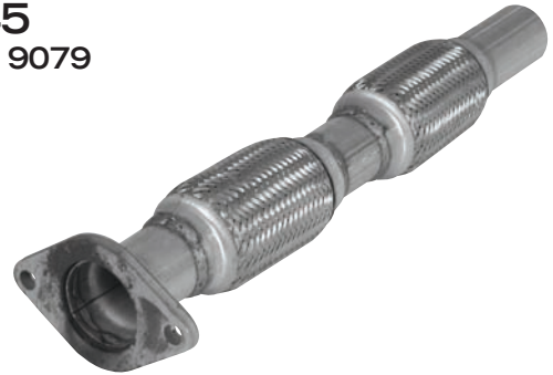
28545 Gasket 9079

1995-03 Ford Windstar 3.8L 1995-00 Ford Windstar 3.0L