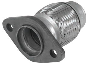
121687 Gasket 9238

1996-97 Chevrolet S10 Pickup 2.2L 1996-97 GMC S15 Sonoma Pickup 2.2L 1996-97 Isuzu Hombre 2.2L With Inner Braid Flex