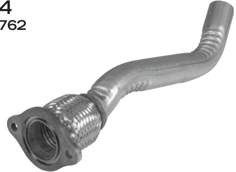
122624 Gasket 8762

1997-04 Buick Century 3.1L 2000-04 Chevrolet Impala, Monte Carlo 3.4L 1997-03 Pontiac Grand Prix 3.1L